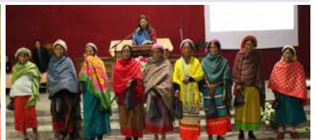
Aling Women Bible Class ga tampeh dung di wangjiu tacham nking khai mai dung