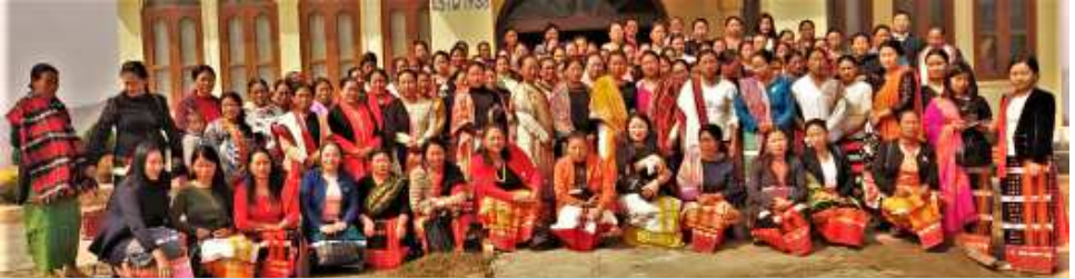
Area wise Women Bible Class Oklong ga wangjoiu khaimai dung