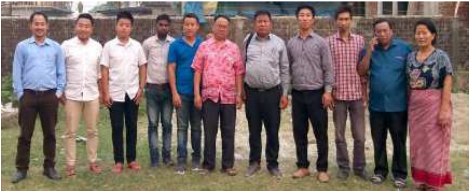
Siliguri mission field ga Evangelist dung khatdi ES nai Mission Secy.

Pariga lienkhai jiu bambo hina se naliu gu kakheng nai nkhhakhai bibojeng niu program hina se wijiui tadkiu jiu bamme. Pasai wanglan rabo ngam hina lengdi Tingwang ga kakheng thiujui bamra khengkhai-e.