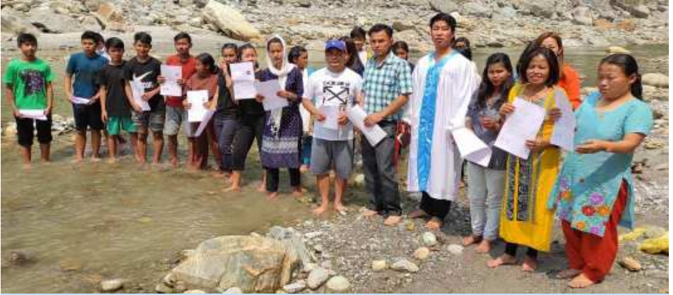
Gayshing, Sikkim Mission Field ga ES niu Baptism lukhai maidung

j) Siliguri Mission Field ga kahumboky kasan thiusura aliu niu chakhuang thiubo Minister (Forest, Environment & Sericulture - GoM) kykhun niu rangkang thiujju Rk. 80,000.00 pikhai bibo jeng niu Tingwang tu dihjiu thuongkiu bamme. Pipat khai bibo kykhun leng aliu mathiu kakheng thiukhai jiu pijju Tingwang niu thoidam khaisan bambo thiu milo.