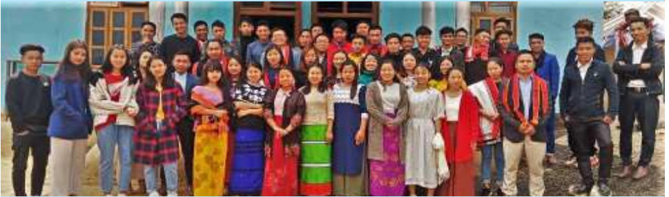
Shingra Baptist Church ga tadkiu mibo Youth Bible Camp ga wankhai maidung