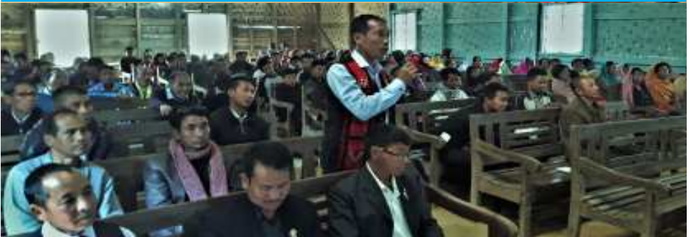
Areawise Mission Consultation Taningjam ga tadkiu bambo