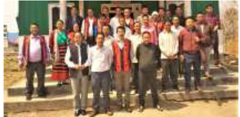
Juna ga Area wise Men Bible Class tadkiuboga wang joukhai mai dung

Haibo program ga wang jiu katipao thiukhaimai khatdi Delegates thiujiu wangkhaimai mathiu tu thuanne, nkiujiu chalungdi jiu program ndeng khaibibo Juna Phumling tu dijiu thuanne, Phumling gu ministry ga Rapiu niu thoikhaimai sanbo thiumilo.