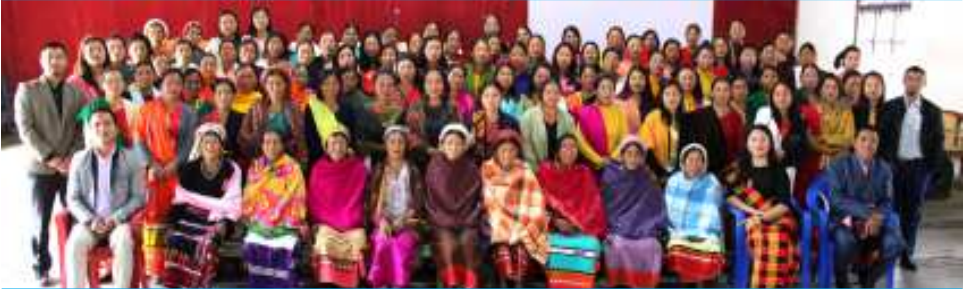
Areawise Women Bible Class Aling ga tadkiu khaibo