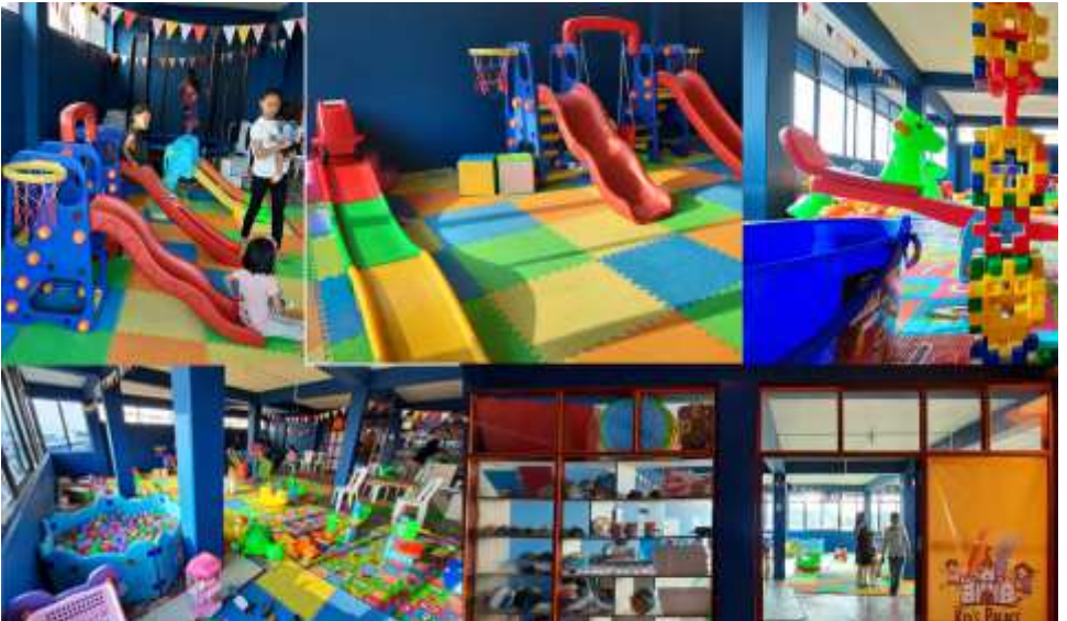
UBC, Tml. BYS niu Income Generation gu project thiujiu nahmai dung wangjiu athienbo ky taliu khai bamme. Pabam niu sai, “Kids Palace, 1st Floor, Daimai Complex, Tml. Bazaar”