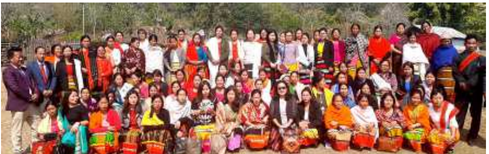
Area wise Women Bible Class Niamning ga tadkiubo ga wangjou khaimai dung

Haibo Bible class nia tadkiu boga Aling B/Ch. khatdi Niamning B/Ch. niu chamrang ndeng khaijiu aliu tu chagiang mawi khaibo ronna makjiu mess fee lumak jiu chalung dijiu katiu kasak matha ganiu wangmai mathiu leng tiuwi sakwi bo khatdi paman kakungbo chami-chakha, chapiubuan phungpad jiu macha mawi khaibi bojeng niu Women Department, LNBA-M lam su Phumling nia tu dijiu thuan kiu bo madu khai-e. Phumling nia riga Tingwang niu thoidam keng jiu pikhai bo thiu milo.