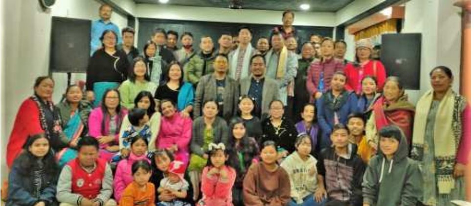
Gayshing, Sikkim ga Evangelical Baptist Church members maidung.

Tingwang gu lungsiat penniu Liangmai Baptist Mission niu thaikum (2021) January gasu March katangbo lung ga changam kamkhai mibo pahang ga lenkhai-e.