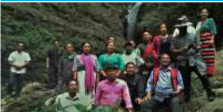
Area wise Men Bible Class Juna ga tadkiu lujiu pabam kawibo lam meng taki tad bambo