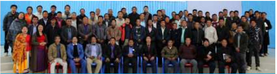
48th ADA Delegates