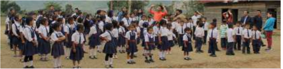
Dev. Dept. gu Nbiu Luangrian School (Dikiuram) ga LNBA-M Staffs dung meng phui tad bambo