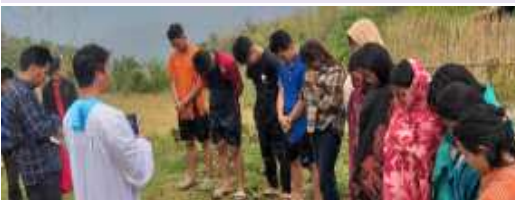
Chakha Phumling gu chabuanmai dung khang 12 tu Executive Secretary niu Baptism kam khaibo.