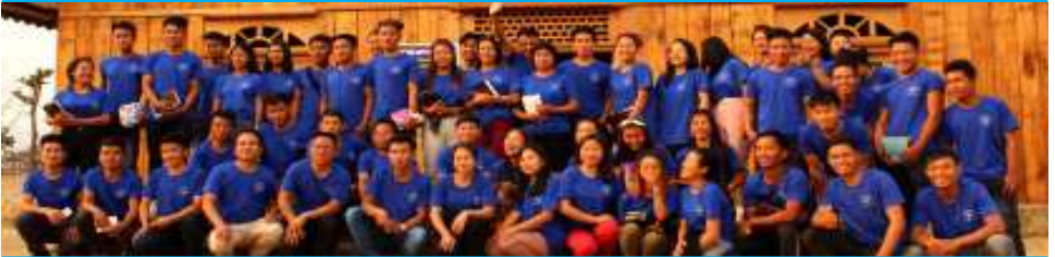
Areawise Youth Music Camp Maguilong ga tadkiu khaibo